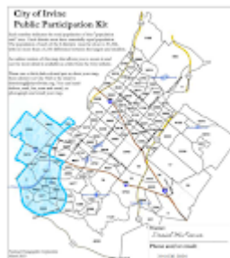
Screen Shot 2023-06-28 at 7.34.45 PM.png 647K