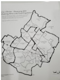
district map 3 .jpg 3243K