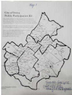
district map 2.jpg 3916K