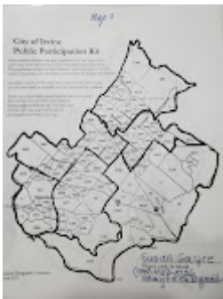
district map 2.jpg 3916K