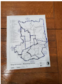
4-7-23 6 district map .jpg 7026K